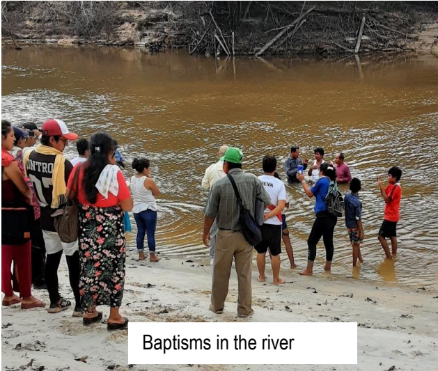
Baptisms in the river